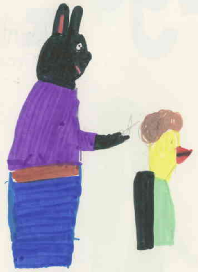
Giving a haircut.