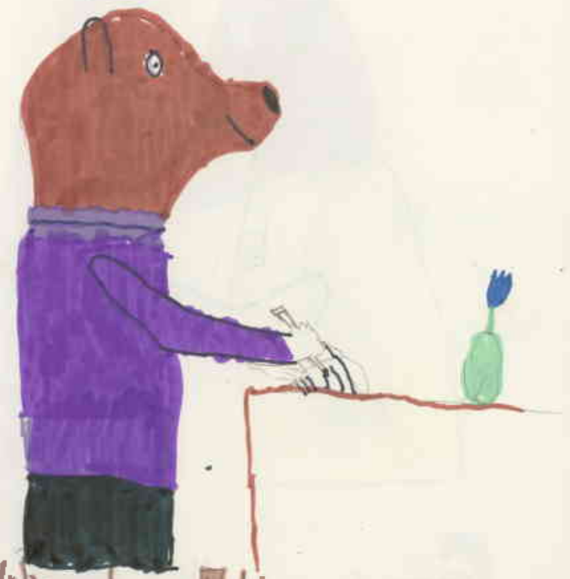
Writing down Fables