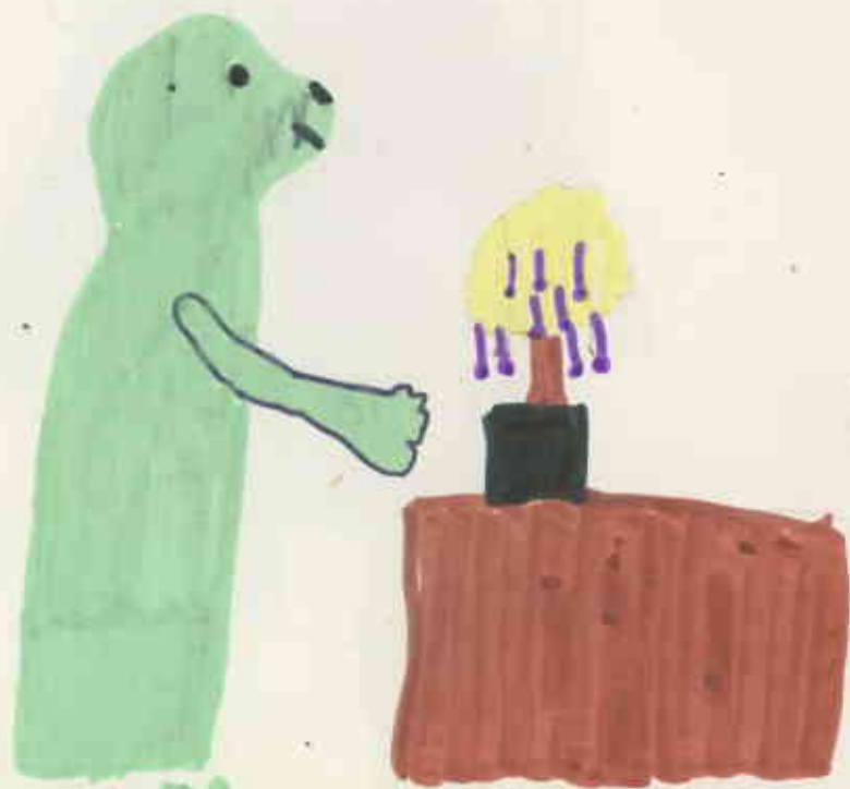
Finding New fruit.