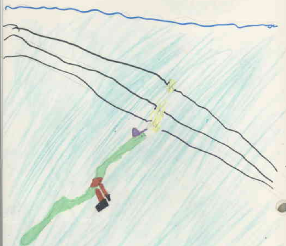
Checking his Equipment