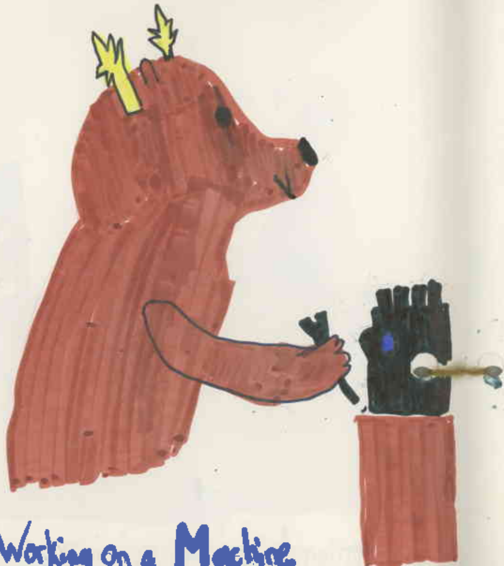
Working on a Machine.